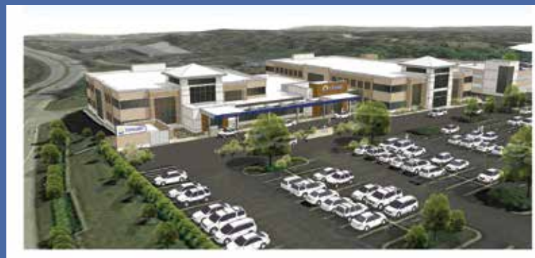
Anderson Professional Center