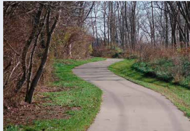
Ohio River Trail near Belterra Park & Gaming and Entertainment Center

The concept involves multiple entities including park districts, townships, villages and cities that are working together to complete the next 14 miles.