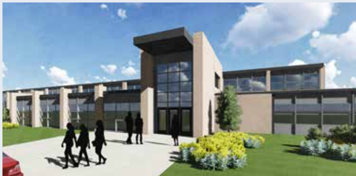
Rendering of Anderson High School's new entrance

School also will undergo significant renovations this summer with a completion date during the 2018-19 school year.