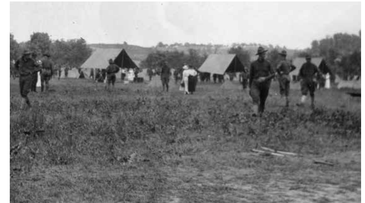
One newspaper report described how the men in training found every minute between reveille and taps occupied. During their recreation periods, they were urged to study army regulations and instruction books.