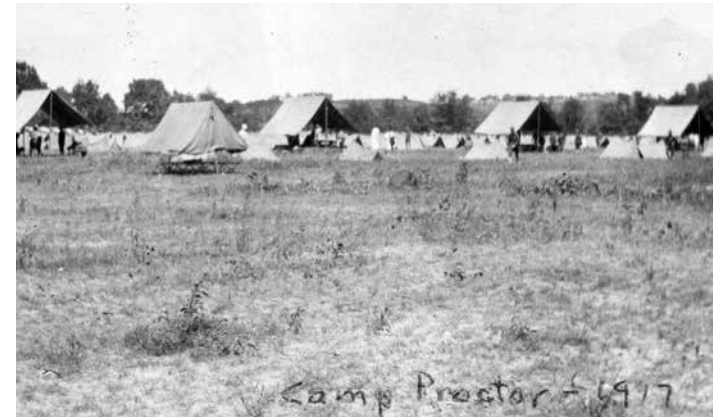
Throughout 1917, reports of training at Camp Procter appeared in Cincinnati papers. On Sundays, visitors came to the camp. Bayonet drills, exhibitions of military maneuvers and practical demonstrations of the use of rifles were shown to spectators.