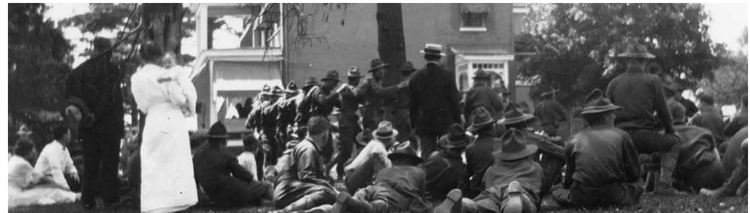
The exact date this photo was taken in 1917 is not known, but reports show there were frequent ceremonies hosted at the camp. The Enquirer of Aug. 20, 1917, reported “nearly a thousand visitors flocked to Camp Procter yesterday. A dress parade was held by the Machine Gun Company and men of K Company.”