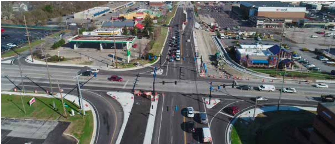
Intersection of Beechmont Avenue and Five Mile Road

Construction-related traffic delays at Beechmont and Five Mile soon to be eliminated as intersection project nears completion.