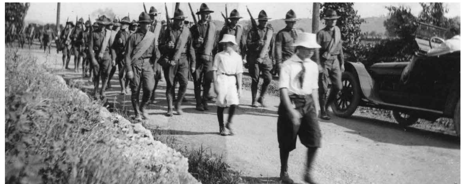
Men of the Ohio National Guard from Camp Procter march along Kellogg on their way to Coney Island to board a boat to downtown Cincinnati. From there they travelled by the Cincinnati, Milford and Blanchester traction trolley to Blanchester where they were federalized into the regular army.