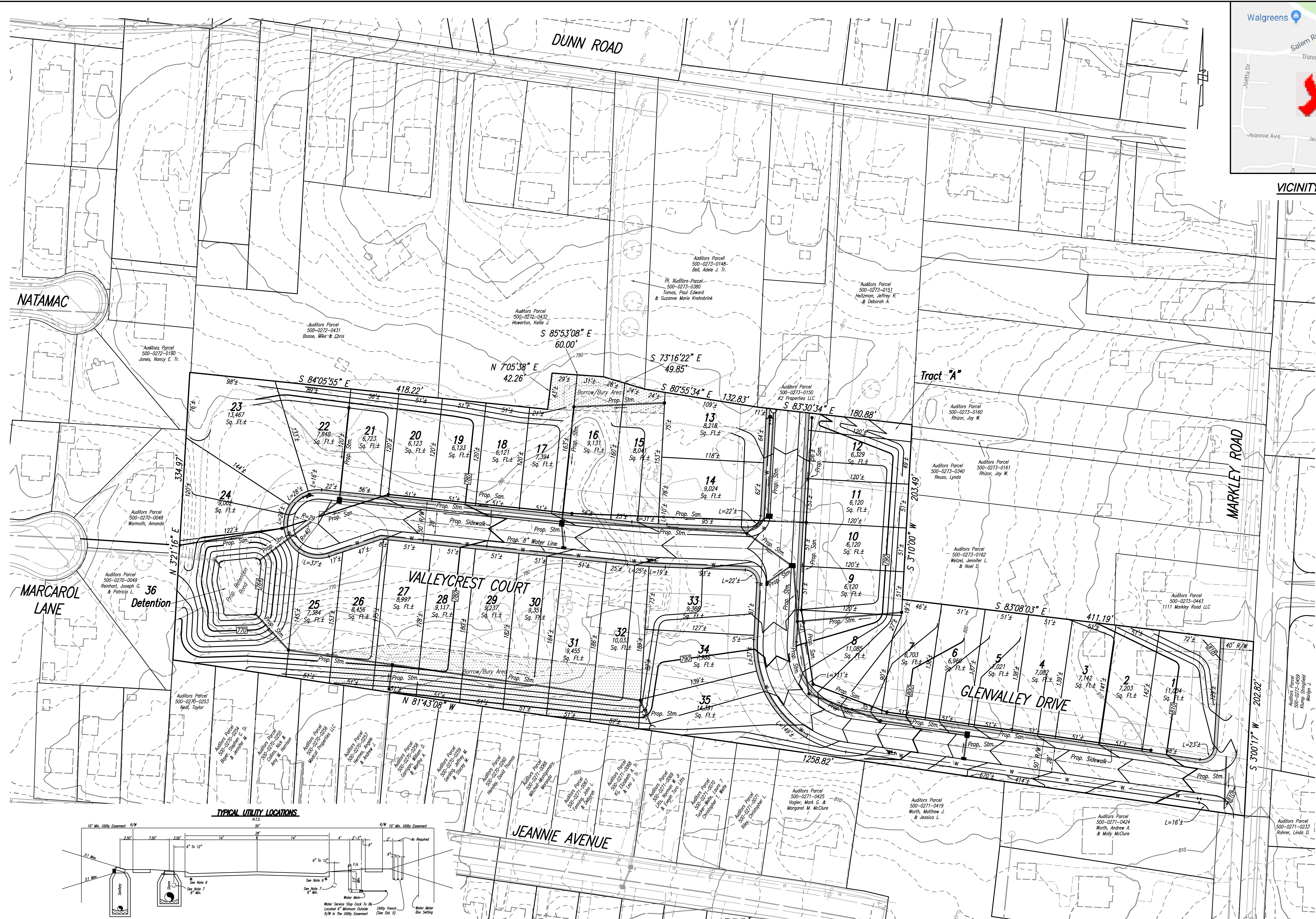
TYPICAL UTILITY LOCATIONS